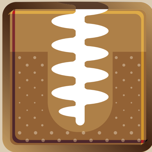
鑽孔機 Earth Auger

Stable Power Output , Suitable Reduction Gear Ratio , Varied Bits in Wide Purpose Range , Best Working Efficiency.